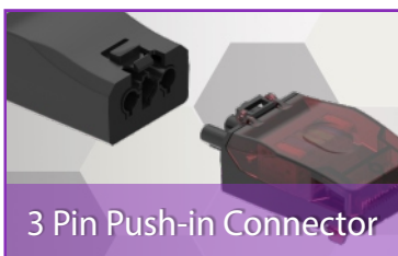
3 Pin Push-in Connector