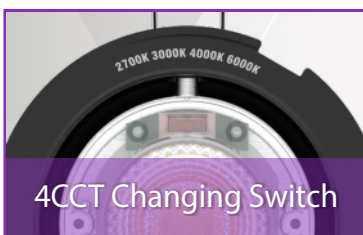
4CCT Changing Switch