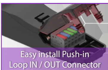
Easy install Push-in Loop IN / OUT Connector