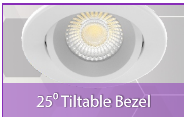
25° Tilttable Bezel